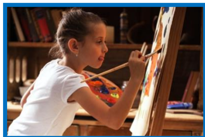
Grades: K-2 and 3-5 Artist: Taylor Komara

Through theatre games and improv activities, students will explore the joy of using their voices, bodies, and imaginations to play and learn about performing and theatre arts. They will learn how to become their own storytellers through improvisation & the creation of their own scripted material.