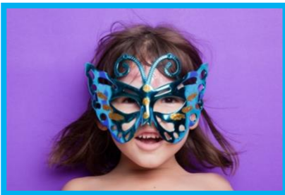
Grades: K-2 and 3-5 Artist: Cher Wilson

Students will discuss similarities of superhero images and what a superpower means to them. Students will make a connection with superpowers of a superhero while recognizing their own personal strengths and capabilities. They will then create a superhero craft in their likeness and discuss their personal superpowers/ capabilities and wishes.