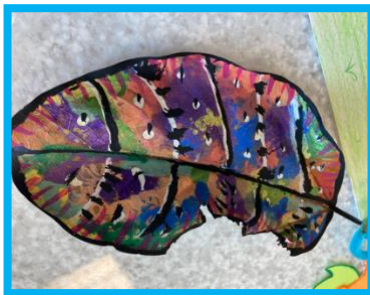
Grades: K-2 and 3-5 Artist: Jose Mendez

In this exciting unit, students will embark on an ocean adventure, learning about the wonders of the sea while discovering new ways to display their coral reef and fish. They'll explore Guyotaku Fish Printing and build 3D biomes to showcase their marine life. We'll also dive into the five oceans and their unique characteristics, focusing on coral reefs and their significance. Students will learn about sea turtles, their life cycle, and conservation efforts, and discover fascinating facts about crabs, jellyfish, and other marine creatures.